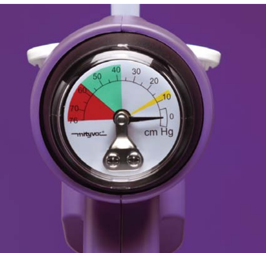
Easy-to-read color-coded gauge