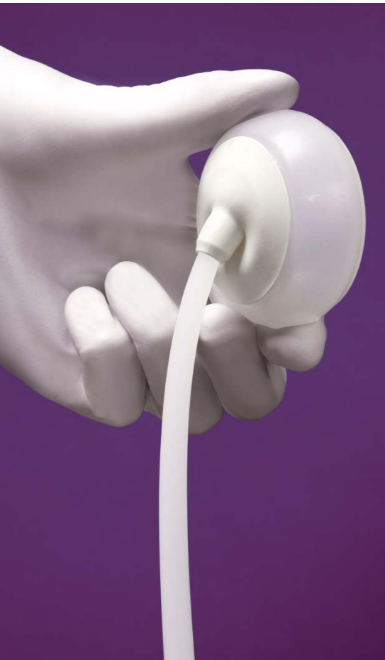
New low-profile M-Style cup