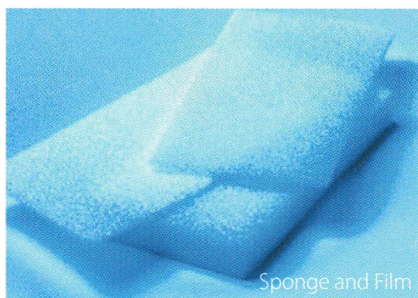
Sponge and Film